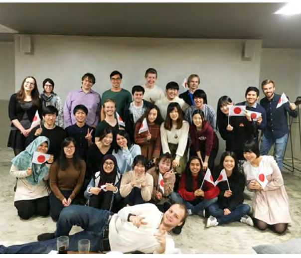
He enjoys residence life doing things with his best friends in the dormitory.

dedicated to international students. I was sure that it would give me the opportunity to meet and study with people from different countries, to improve my Japanese, to know Japanese society through courses that seemed interesting to me. All this has been the case.