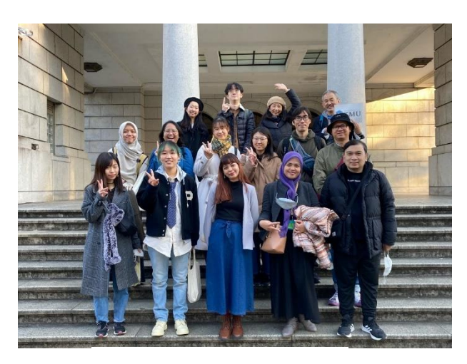
[a group photo]